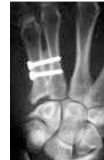
Fig 4. Postoperative radiograph of case 1.

Both patients were satisfied and had a good cosmetic appearance without malalignment, malrotation or shortening of the fifth ray. The fifth metacarpal was stable and the transverse metacarpal arch preserved. There was flexion/extension on the ulnar side of the hand through the fourth CMC joint (Fig 4). Range of motion at the wrist was full and pain-free. Radiographs confirmed union between the fourth and fifth metacarpal bases (Fig 5). There were no infections or neurological complications.