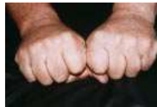
Fig 3. Preservation of the metacarpal arch and motion of the ulnar side of the hand in case 1.

One or two 2.7mm cortical lag screws are placed just distal to the CMC joint to fix the fifth to the fourth metacarpal. (Fig 5,6 and 7). Fluoroscopy is used to confirm the position of the fixation. 10-11 Autogenous cancellous bone graft is added. The dorsal periosteal/capsular flap is sutured to the volar joint capsule to act as an interposition graft between the fifth metacarpal and the hamate.